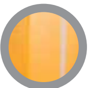
TANK WITH CLEAR VERTICAL LINE FOR BETTER LEVEL READING