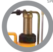
Ø 44 BRASS PUMP WITH HYDRAULIC AGITATOR LARGE WATER RESERVOIR