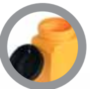
CAP FIXING SYSTEM