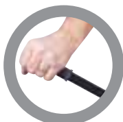
METAL CONTROL LEVER