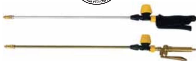
Kit for the use with pesticides [UNI, RECORD AND SUPER SPRAYERS]