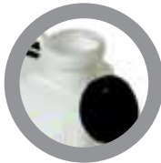
CAP FIXING SYSTEM