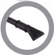
TUBE END WITH POWDER SPREADER