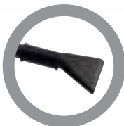
TUBE END WITH POWDER SPREADER