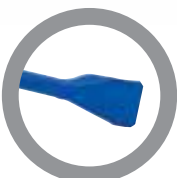
TUBE END WITH POWDER SPREADER